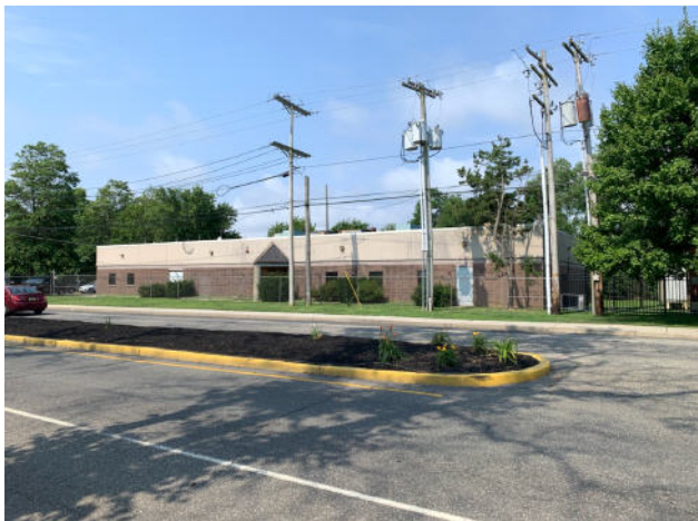
The Sprint Building near the Main Gate at Sea Girt - the future home of the NGMMNJ.

Finally, the museum has entered the planning stages for a relocation. The museum itself will be moved to occupy a building adjacent to the entrance of the Sea Girt base, which will be renovated later this year. Stored collections will be transferred to a facility at Lakehurst Naval Air Station. The move is currently scheduled to take place in the summer of 2020.